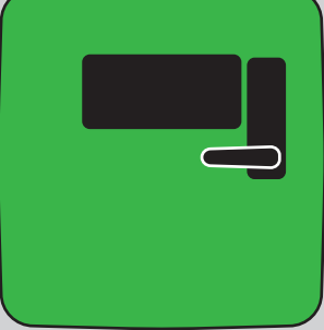
Defib Store 4000 lle